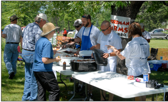
2010 Creighton RibFest in Bruce Park