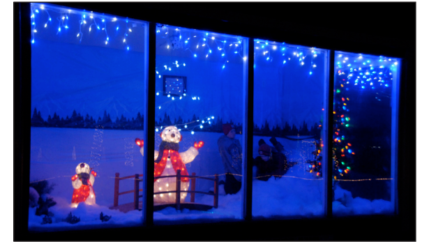
One of Santa's shadowboxes in Bruce Park