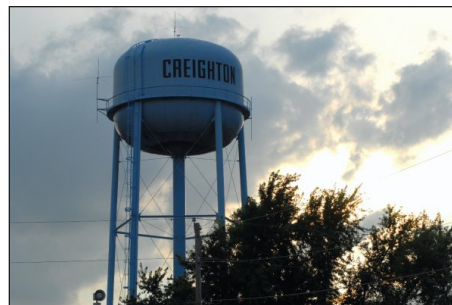
Creighton's water tower beckons visitors to town, as it can be seen for miles around.

Hunting – The area is well-known for its abundance of deer, quail, pheasants and turkeys that will please any avid hunter.